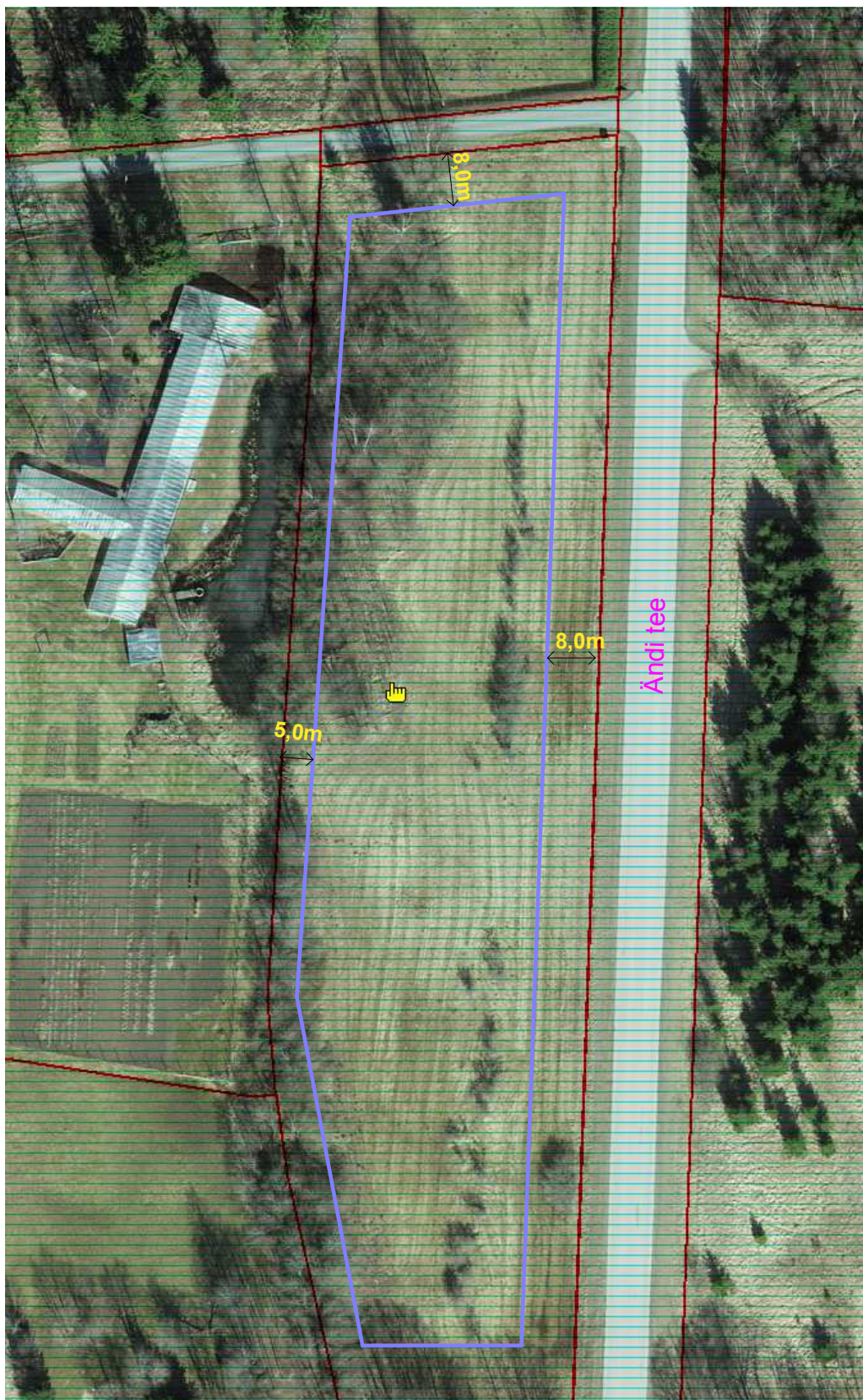
Lisa 1. Ehitusala skeem. PTH-18-144 Tüki küla, Ändi tee 20a